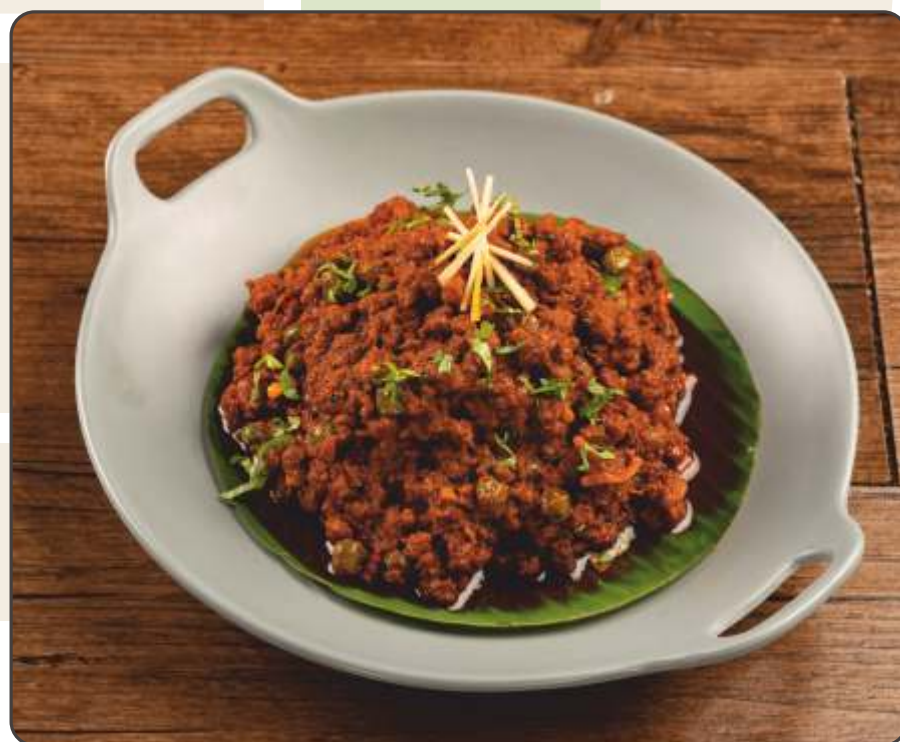
THE DESSERT LANE

*WE LEVY 5% SERVICE CHARGES *TERMS AND CONDITIONS APPLY *RIGHT FOR ADMISSION RESERVED *GST EXTRA - AS APPLICABLE ON FOOD